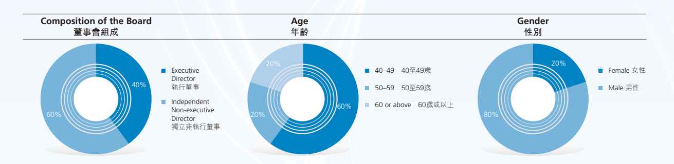
(As at 31 December 2021)

各董事具備與本集團業務營運及發展相輔相 成的技能、經驗及專長且來自不同背景,故 董事會組成已達致良好平衡。各董事的教育、 專業背景、專業知識、性別、年齡、文化及 行業經驗呈現多元化。