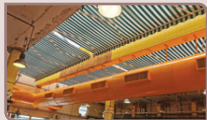
Kowloon City Market Cooked Food Centre and Kai Tak East Sports Centre Improvement Works for DX Unit System