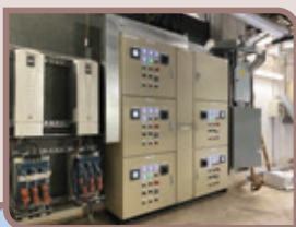
Ho Man Tin Government Offices Replacement of Air-Cooled Chiller and Modification of Chiller Plant