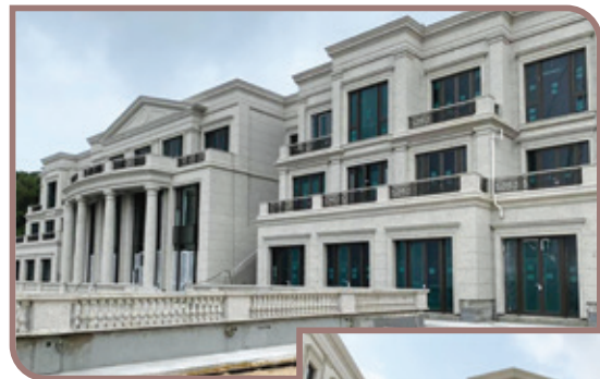
House A, No.75 Peak Road (R.B.L. 670 s.A.) Superstructure Works Main contract for one prestige residential house including E&M installation