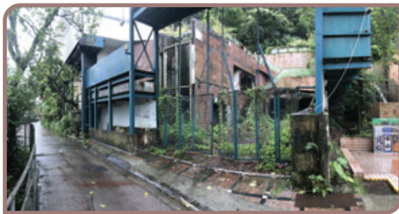
No. 16 Bowen Road Substructure Works Main contract for the Demolition, Foundation & ELS Works