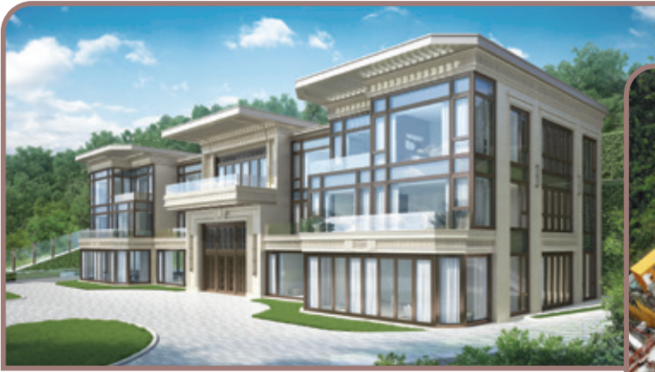
House B, No.75 Peak Road (R.B.L. 670 R.P.) Superstructure Works Main contract for one prestige residential house including E&M installation