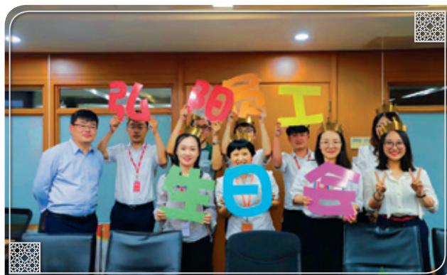
Redsun's employees joining staff birthday party 弘陽地產僱員參與員工生日會