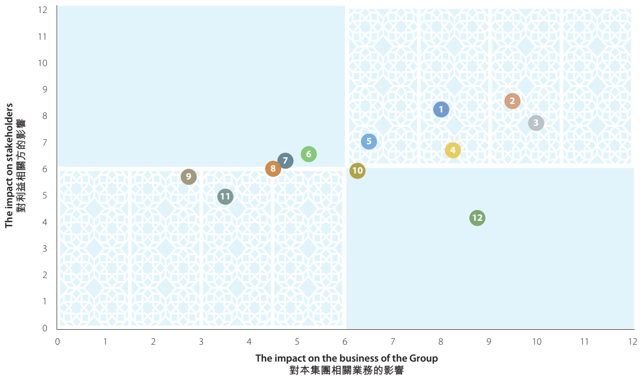
An analysis matrix of key issues 重要性議題分析矩陣

為了了解各利益相關方所關注的議題，增強本報告的針對性，弘陽地產於本年度開展了利益相關方調查，通過分析主要內外部利益相關方（如客戶、投資者、僱員及供應商）對調查問卷反饋的評分結果，建立以「對本集團業務的影響」和「對利益相關方的影響」為二維維度的重要性議題分析矩陣，識別出本集團利益相關方關注的重大議題。