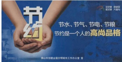
Poster about conservative use of resources

In addition, the Group promotes paperless office, encouraging its employees to make the best of computers to reduce paper usage, such as using e-mails or e-fax, or adopting electronic document management system for document archiving. Daily communication with customers is conducted via e-mails to the possible extent and electronic versions are provided for the Group's publications to reduce paper consumption. When it is necessary to print any document, employees are required to print double sided to save papers. For the used printed papers, confidential documents are destroyed with a shredder while general documents are put in waste paper recycling boxes at offices to be delivered to recycling companies.