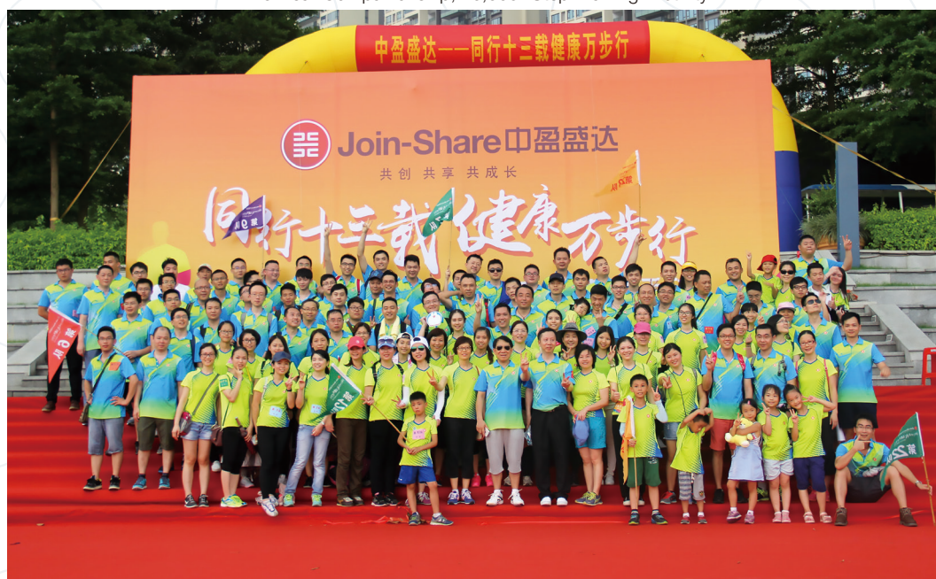
“13-Year Companionship, 10,000- Step Walking” Activity

The Group is concerned about the environmental issues of the communities in which it operates and has organized a variety of environmental activities for its employees in hope of raising their environmental awareness. In particular, on 4 June 2016, the Group held a hiking event comprising foot orienteering, group games, sightseeing and fitness exercise. The event under the theme of “13-Year Companionship, 10,000- Step Walking” (同行十三載·健康萬步行) aimed to promote “happy fitness, happy sports & low-carbon travel”, thereby encouraging its employees and their relatives and friends to care more about the environment and reduce the use of vehicles so as to reduce carbon footprint. The event also contributed to the building of corporate culture, enriching the spiritual and cultural life of employees, raising their awareness of health and fitness and enhancing corporate cohesion, thereby creating a happy and harmonious working atmosphere.