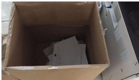
Waste paper recycling box

As a financing guarantee institution, the Group provides services to SMEs across the country through its subsidiaries and branches located in different regions. Conferences and interviews with its subsidiaries and branches and cross-regional customers require long-distance travel, and such frequent use of vehicles would result in considerable carbon emission. Therefore, the Group usually holds internal conferences with its subsidiaries by way of videoconference or teleconference, and suggests having meetings and discussions with its cross-regional customers via videoconference or teleconference. Such measure not only significantly reduces carbon emissions from the Group's operations, but also is time-saving and more cost-effective.