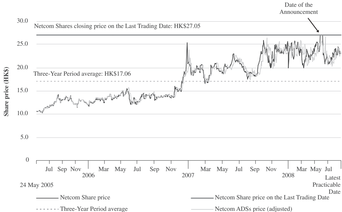
Chart 9 — Daily closing prices of the Netcom Shares and the Netcom ADSs

Chart 9 below shows the daily closing prices of the Netcom Shares and the Netcom ADSs from 24 May 2005 and up to and including the Latest Practicable Date.