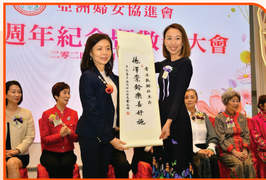
Donation to Asia Women's League Limited 捐贈給亞洲婦女協進會