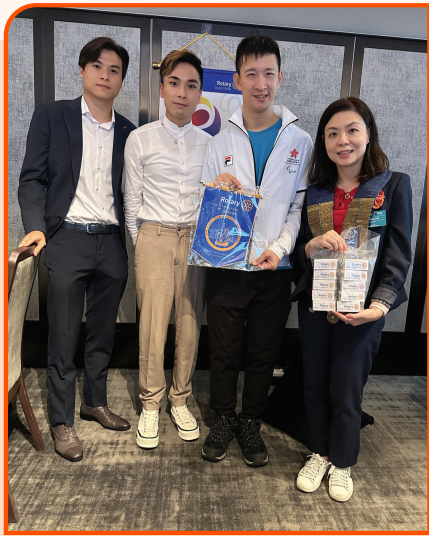
Donation of Oximeter to Paralympic 捐贈血氧計給殘奧運動會