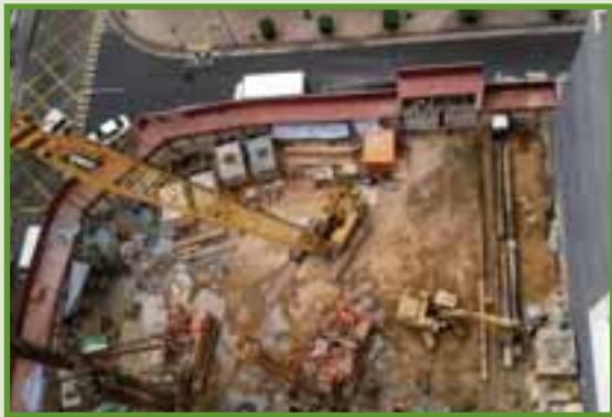
香港荃灣灰瑤角街2-6號 總承包工程，二十一層高工廠大樓 (包括樁基礎及上蓋、機電及裝修工程) No.2-6 Fui Yiu Kok Street, Tsuen Wan, Hong Kong Main Contractor for redevelopment a 21-storey industrial building including construction of sub-structure and superstructure, E&M and fitting out works