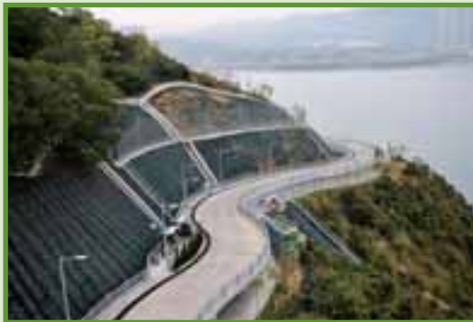
將軍澳接連墳場道路 電氣及消防設備之安裝工程 Footpath Linking Junk Bay Chinese Permanent Cemetery Building Services Installation (Electrical & Fire Services)