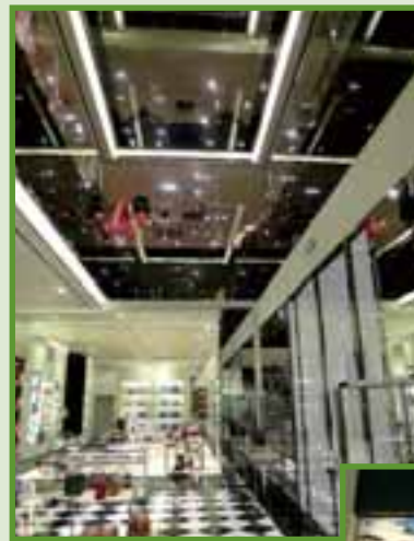
中國浙江省 杭州國際名品街PRADA 店舖裝修工程 PRADA at Hangzhou Euro Street, Zhejiang Province, China Shop fitting out works